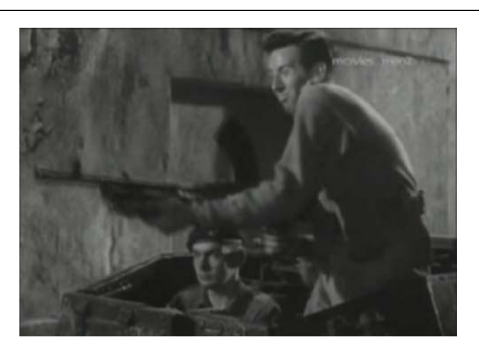
Information courtesy of Graham Lay