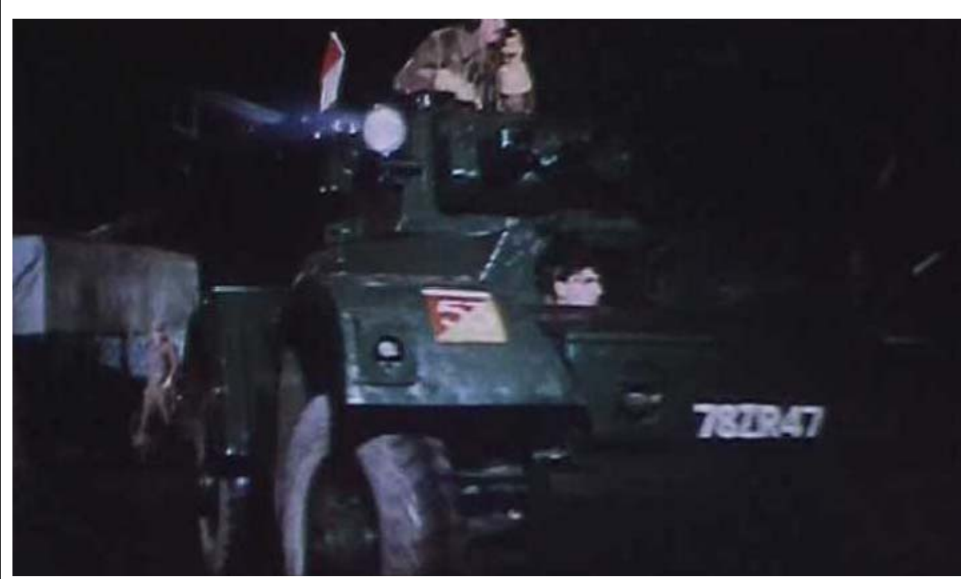
a clearly numbered DAC 78ZR47,

Neither Bombs, Bullets, Jets, Rockets or Daimler Armoured Cars Can Stop Gorgo